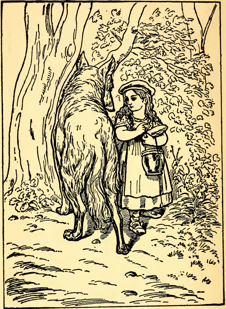
"SHE MET WITH GAFFER 'WOLF."